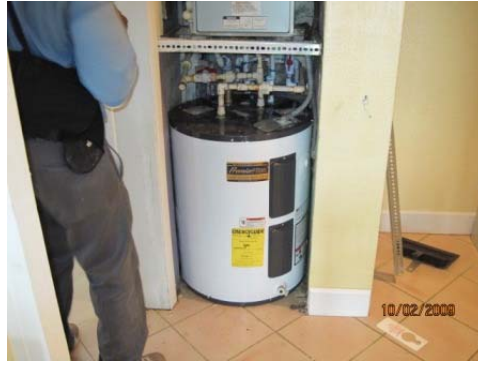
Removal of old water heater and installation of new one room 401