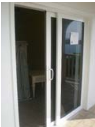
Completed trim and paint to sliding Glass doors