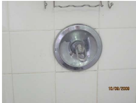
Water leak in Ladies Room poolside shower repaired and re-tiled.