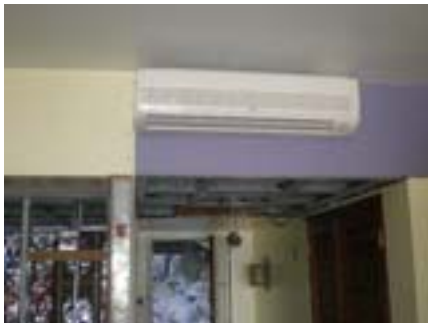
New A/C units being installed.