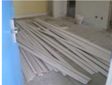
Crown Mold primed and ready to install.