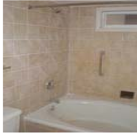
Bath accessories are in place.