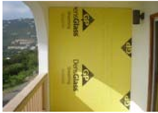
Demising wall to divide balconies.