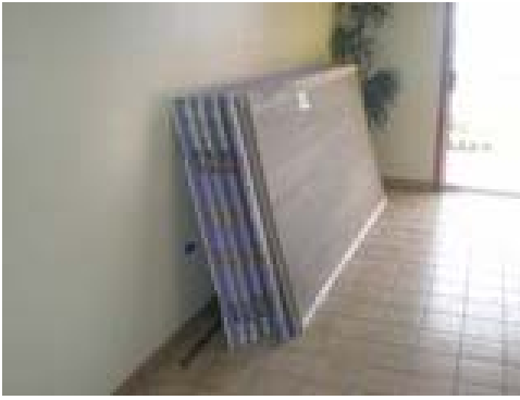
Sheetrock on site to install after rough-in.