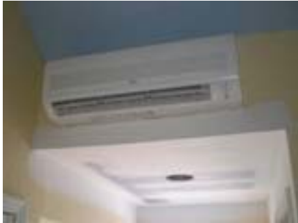
A/C units installed in several units. Drywall complete and ready for paint.