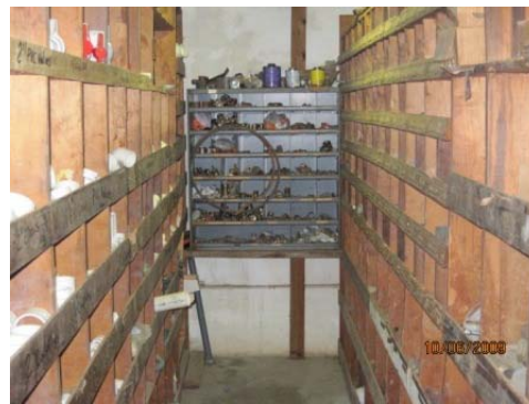
Organizing electrical and plumbing inventories