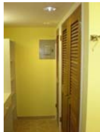
Interior doors finished w/ hardware.