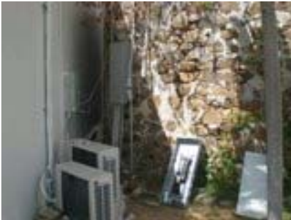
Replaced electric panel behind Castle.