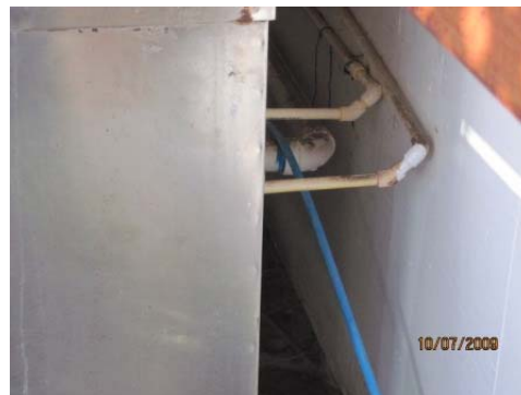
Repairing water and sanitary lines for Pool Bar. Making ready for Grande opening