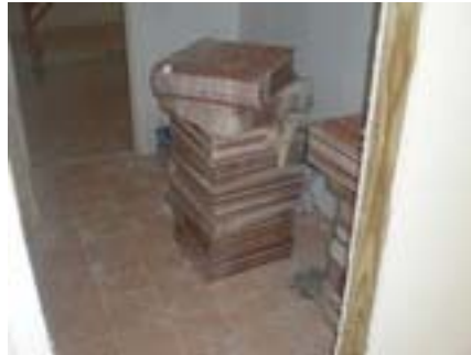
Floor tile ready for installation in the needed units.