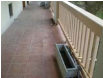
Removal of A/C units from ceilings.