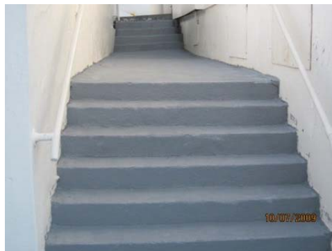
Scraping peeling paint on steps and walkways, and applying non-skid surfacing product.