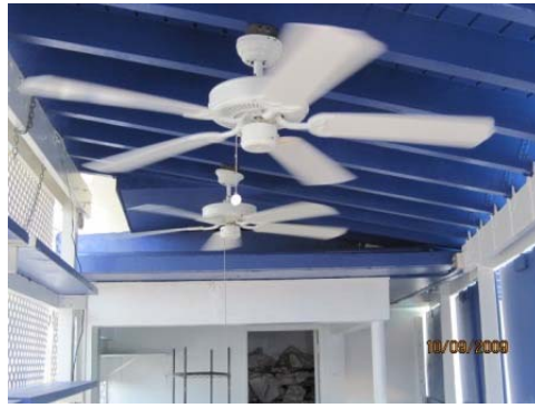
Before installing ceiling fans in Pool Bar After