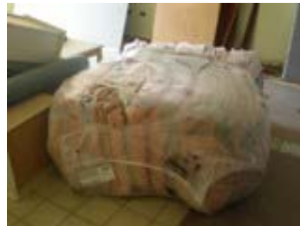
Insulation preparation and staging.