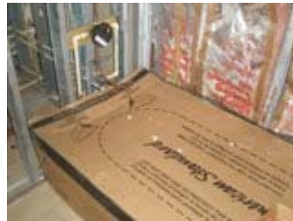
Installation of new tubs and plumb-fixtures.