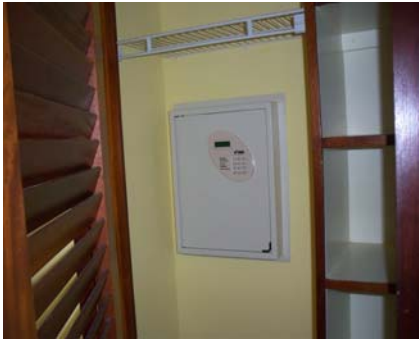
New safes installed.