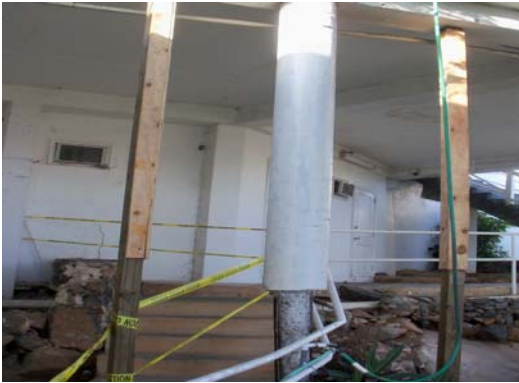
Repairing the columns under the pool deck