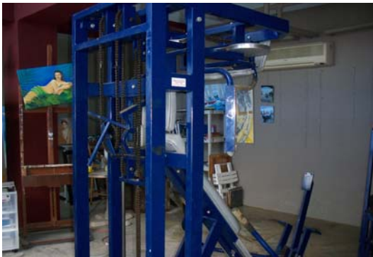
Gym equipment being moved from the Art Room ... then serviced and moved to the Gym