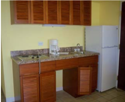
Hotel units new cabinets