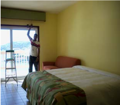
Installing new drapes